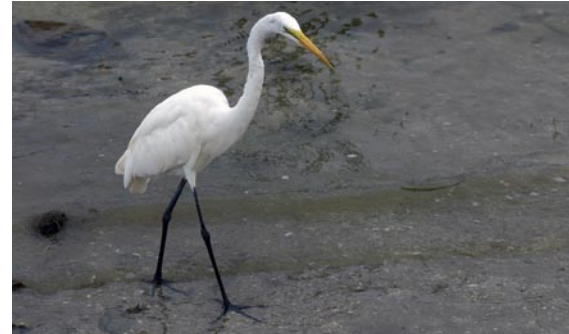
Garza blanca (Ardea alba)