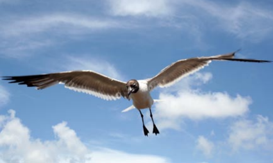
Gaviota reidora (Larus atricilla) (plumaje de verano)