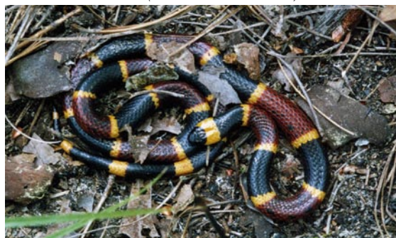
Serpiente coral (Micrurus fulvius)