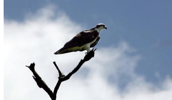
Águila pescadora (Pandion haliaetus)