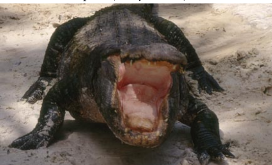
Caimán americano (Alligator mississippiensis)