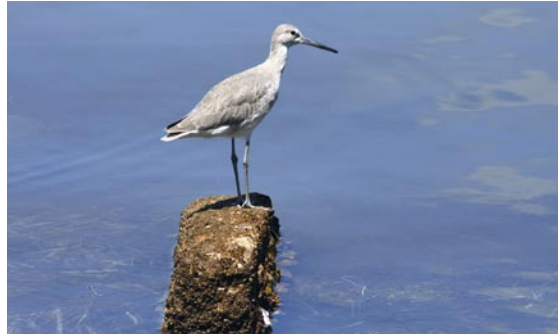
Playero canchuda (Caloptrophorus semipalmatus)