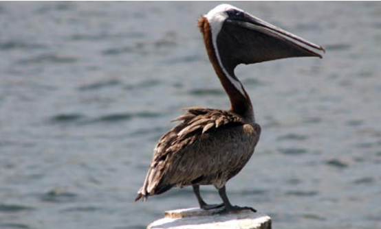
Pelicano (Pelecanus occidentales)