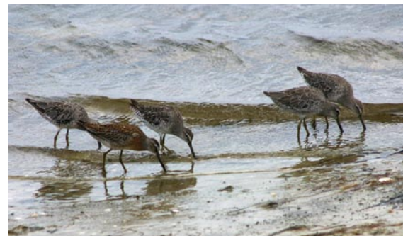
Zarapita (Numenius phaeopus)