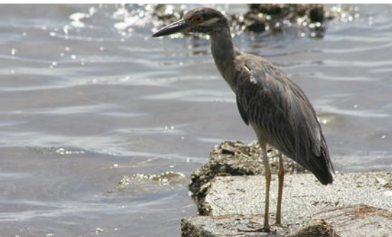
Garza nocturna (Nyctanassa violacea)