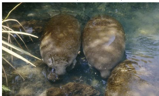
Manatíes (Trichechus manatus)