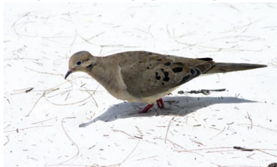
Paloma huilota (Zenaida macroura)