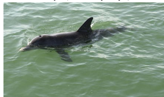
Delfín (Tursiops truncatus)