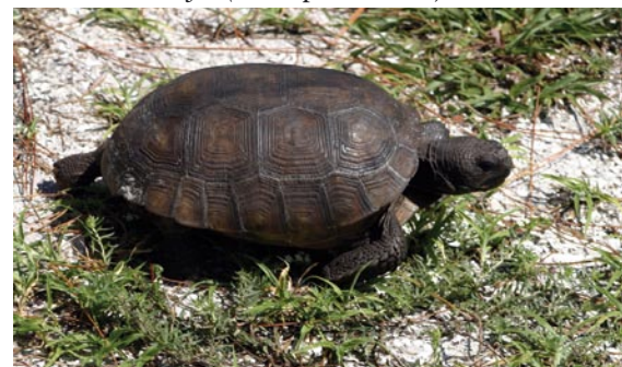
Tortuga gopher (Gopherus polyphemus)