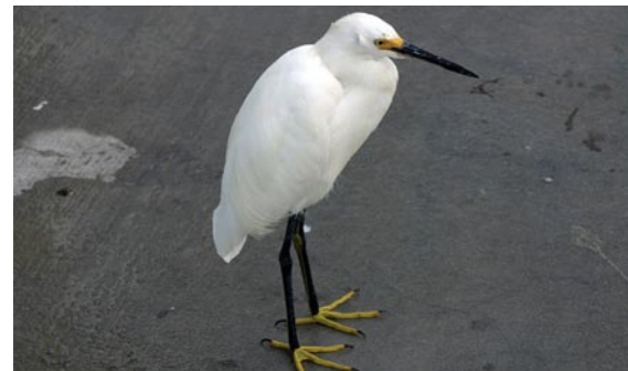
Garceta de nieve (Egretta thula)