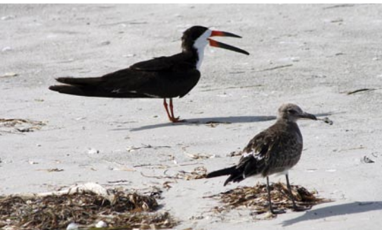
Pico de tijera (Rynchops niger)