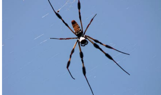
Araña de seda (Nephila clavipes)