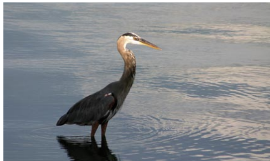
Garza azul (Ardea herodias)